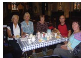
Enjoying our cakes