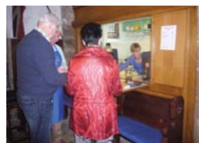
Customers at the Hatch